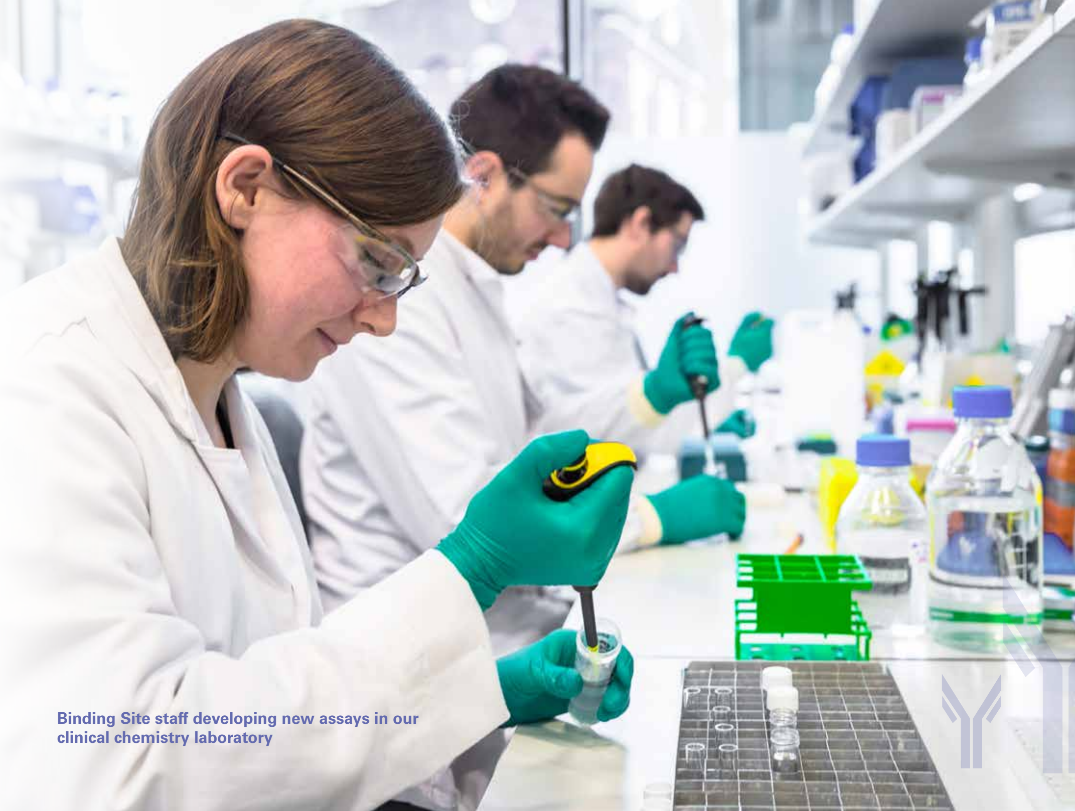
Binding Site staff developing new assays in our clinical chemistry laboratory